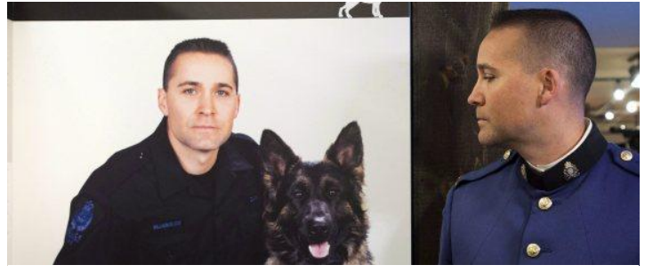
For more info, go to:

The maximum sentence for killing a service animal is 5 years.