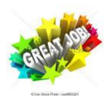
Gull Lake North COP was presented with an award from the Rimbey detachment for their partnership and dedication to service.

A group photo of the Halloween Safety Partners has been attached below.