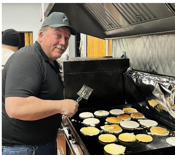
“How am I doing???”