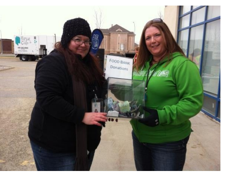
Have a Nice Summer